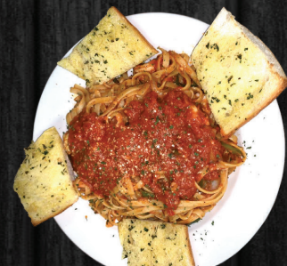
Luigi's Shrimp w/ vodka Sauce